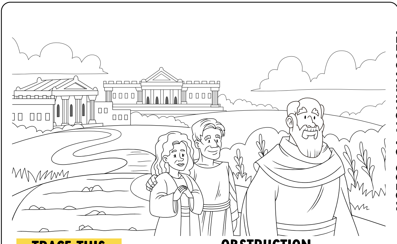
ILLUSTRATION TO COLOR

YOUNGER ELEMENTARY AQUILA, PRISCILLA, AND APOLLOS